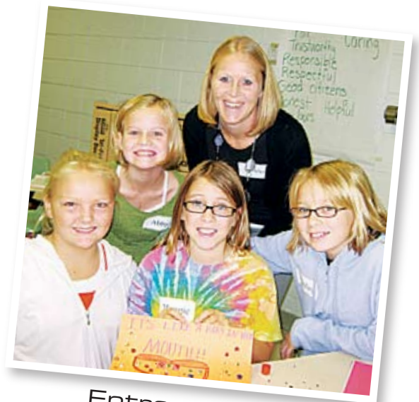
Entrepreneur For a Day Program