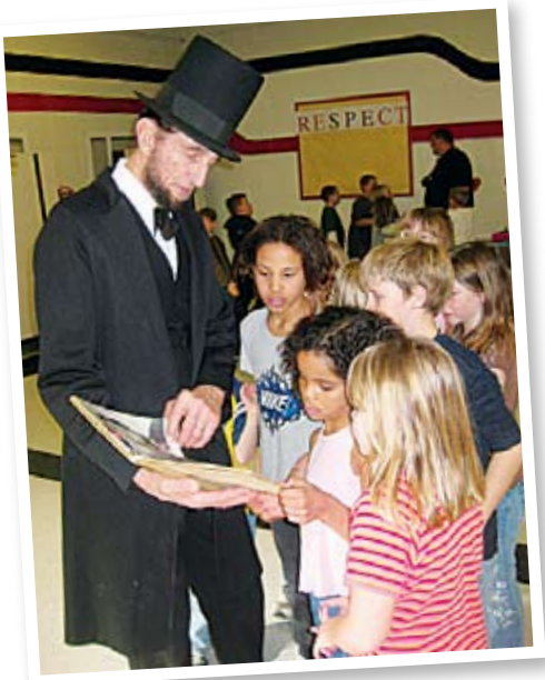
Abraham Lincoln Bicentennial Celebration