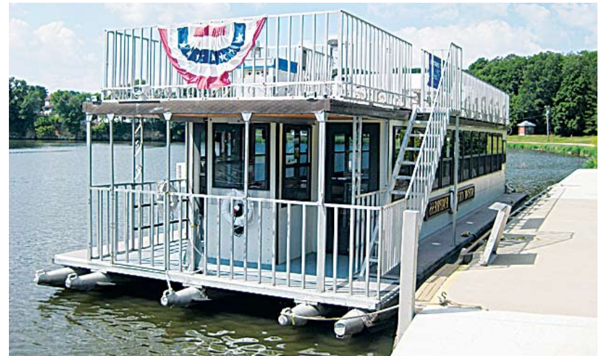
Scenic City Empress

Quakerdale - $5,000 - Farm Program for Youth