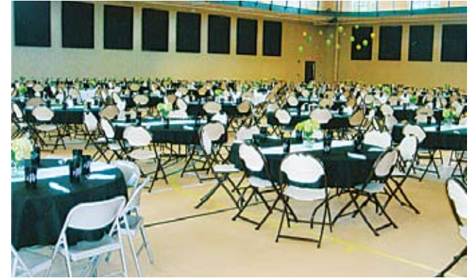
Dale Howard Family Activity Center