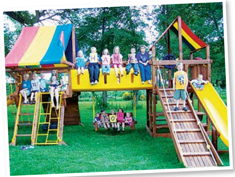
Garden City Playground