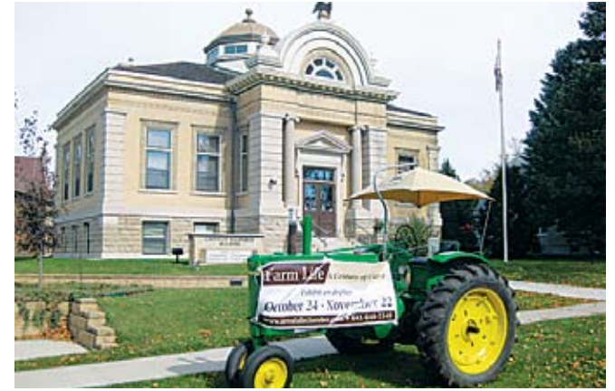
Century of Change Farm Traveling Exhibit.