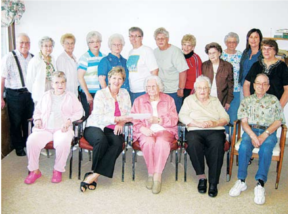
Iowa Falls Community Senior Citizens, Inc. presents a $20,000 gift to HCCEF's unrestricted endowment.