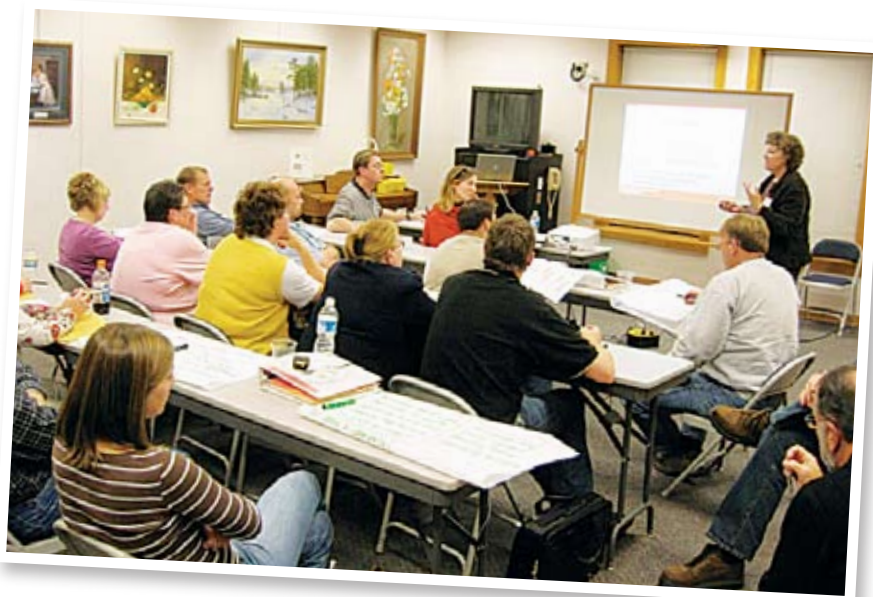
Developing Dynamic Leaders