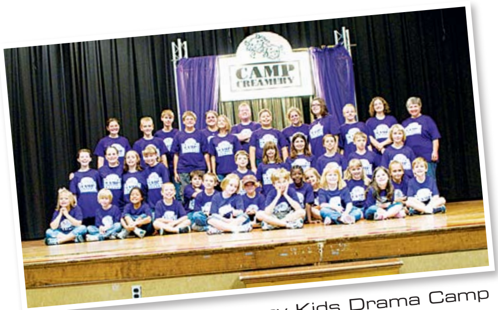
2009 Camp Creamery Kids Drama Camp