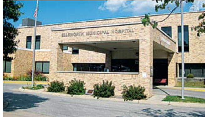
Ellsworth Municipal Hospital