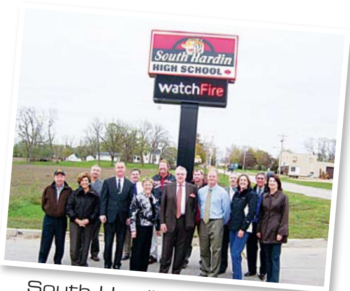
South Hardin High School Electronic Sign