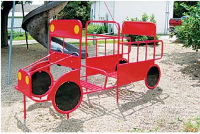
City of Union Playground